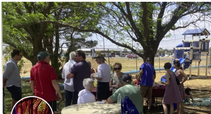
Congregation Shaareth Israel